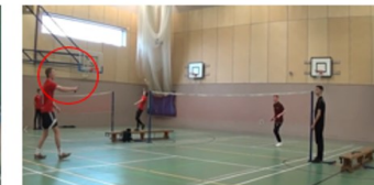
During the shot, my arm straightens to force the shuttle down towards the net at speed and with accuracy.