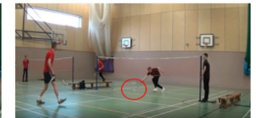
After the shot, the shuttle landed close to the net which made it difficult for my opponent to return.

In this game, on several occasions I successfully executed the drop shot and it resulted in me winning points. I also used deception with this shot, which is a common tactic used in badminton. I swung my arm upwards quickly which indicated to my opponent that I was going to perform a smash shot or an overarm clear but then I flicked my wrist to send the shuttle downwards to execute the drop shot. This was efficient and successful as my opponent was not anticipating a drop shot and they weren't in the ideal position to return this shot and I won the point. At elite level, deception can be vital as the margins for winning are so narrow. However, this shot could have become predictable so throughout the match I varied my shot selection when playing an attacking shot to try and win a point. During this game, I abided by the regulations of badminton as I am wearing the correct kit with appropriate footwear and I am also playing against another male.