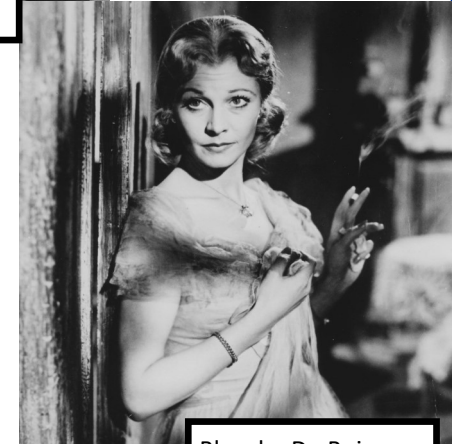
Blanche Du Bois