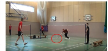
After the shot, the shuttle landed close to the net which made it difficult for my opponent to return.

In this game, on several occasions I successfully executed the drop shot and it resulted in me winning points. I also used deception with this shot, which is a common tactic used in badminton. I swung my arm upwards quickly which indicated to my opponent that I was going to perform a smash shot or an overarm clear but then I flicked my wrist to send the shuttle downwards to execute the drop shot. This was efficient and successful as my opponent was not anticipating a drop shot and they weren't in the ideal position to return this shot and I won the point. At elite level, deception can be vital as the margins for winning are so narrow. However, this shot could have become predictable so throughout the match I varied my shot selection when playing an attacking shot to try and win a point. During this game, I abided by the regulations of badminton as I am wearing the correct kit with appropriate footwear and I am also playing against another male.