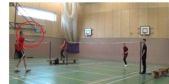
During the shot, my arm straightens to force the shuttle down towards the net at speed and with accuracy.