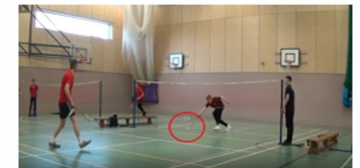
After the shot, the shuttle landed close to the net which made it difficult for my opponent to return.

In this game, on several occasions I successfully executed the drop shot and it resulted in me winning points. I also used deception with this shot, which is a common tactic used in badminton. I swung my arm upwards quickly which indicated to my opponent that I was going to perform a smash shot or an overarm clear but then I flicked my wrist to send the shuttle downwards to execute the drop shot. This was efficient and successful as my opponent was not anticipating a drop shot and they weren't in the ideal position to return this shot and I won the point. At elite level, deception can be vital as the margins for winning are so narrow. However, this shot could have become predictable so throughout the match I varied my shot selection when playing an attacking shot to try and win a point. During this game, I abided by the regulations of badminton as I am wearing the correct kit with appropriate footwear and I am also playing against another male.