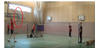
Before the drop shot, my technique is correct as my right arm is at about 45° to hit the shuttle at its highest point.